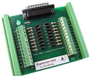
Expansion Unit for AD_USB-Box (scope of supply)

The AD_USB-Box provides 8 single-ended or 4 differential analog inputs respectively, and 4 digital inputs. Additional 16 digital inputs are available by connecting the Expansion Unit , which is included. The inputs of the Expansion Unit are extra protected against short circuit and surge.